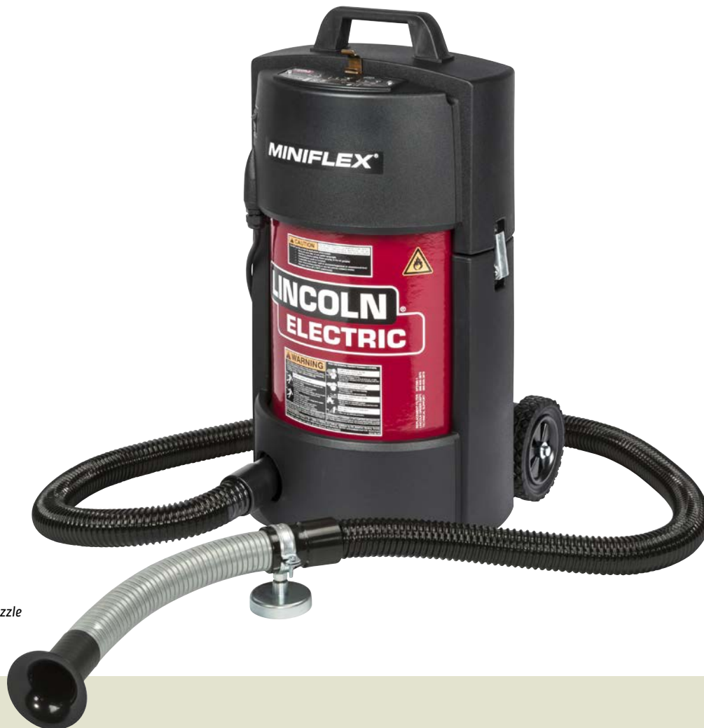
K3972-5 Miniflex® with EN 20 Extraction Nozzle