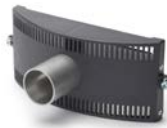
Hose Connection Outlet Order K2389-2