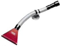
SHFA Flat Suction Nozzle Order K639-5