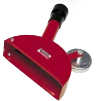
UNM Suction Nozzle for Heavy Smoke Order K639-6